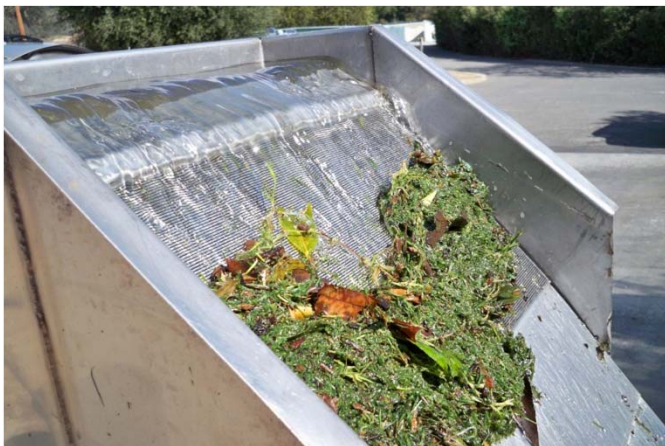
COANDA screens provide instant dewatering and are self-cleaning