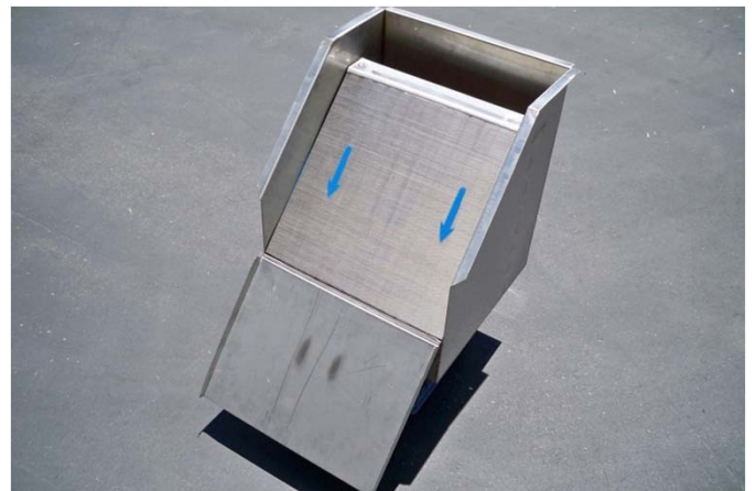
Rugged All Stainless Steel Construction

COANDA has the perfect solution for dealing with heavily concentrated solids in water. This product is suitable for: