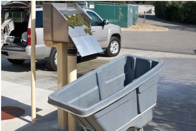
Treatment of Pressure Washwater for Recycle and Recovery of Solids for Composting

Particulate Removal COANDA screens remove everything larger than fine sand.